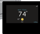
90% Gas Furnace

Ion System Control – Our innovative Ion System Control includes full-color touch screen technology for intuitive and powerful command over temperature, humidity, comfort scheduling, energy management and more.