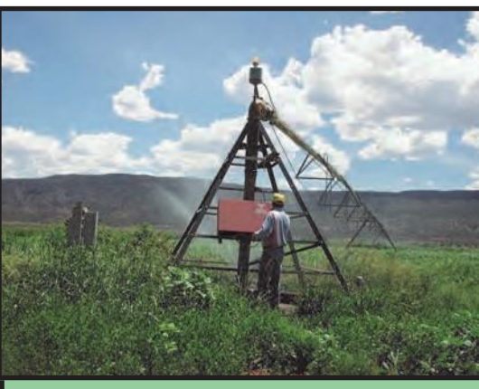
Center Pivot Irrigation in Paradox

would have to be added to the existing plan, if possible, through a water court process, or alternatively, a new plan approved by the court. Use Form GWS-44 in applying for this type of permit.