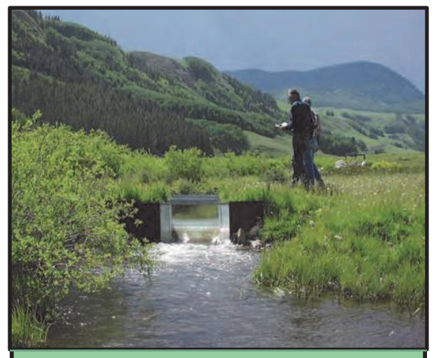
Water Rights Administration on East River

trial unless the parties can reach agreement on any contested issues. If the case goes to trial, the judge will set the matter for hearing and decide whether or not the application should be granted. Should any party participating in the case be dissatisfied with the judge's ruling, they can then appeal directly to the Colorado Supreme Court. The total time required for this process varies anywhere from four months to two years, depending on the complexity of the case.