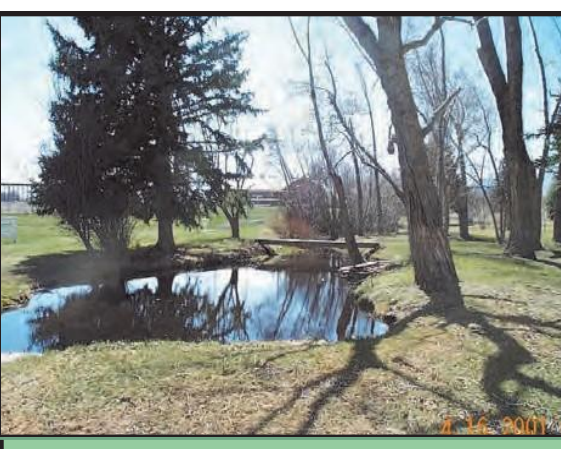
Pond in Wet Mountain Valley

on the system than can be satisfied by the physical amount of water available. Therefore, under the priority system ("first in time, first in right"), when the most senior rights are making a call for water, the most junior rights have to curtail diverting until the calling senior rights are satisfied. A new storage right would be so junior, that in an over-appropriated drainage system,