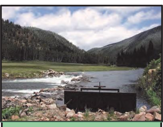
Diversion Structure on Crystal Creek

of water. When the stream is carrying five cfs of water or more, all of the rights on this stream can be fulfilled. However, when the stream is carrying only three cfs of water, priority number three will not receive any water, with priority number two receiving only half of their right. Priority number one will receive their full amount of two cfs under this scenario. This process of allocating water to various water users is traditionally referred to as water rights administration, and is the responsibility of the Division of Water Resources.