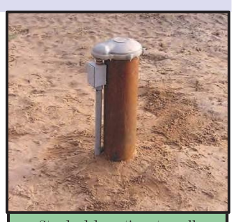
Standard domestic water well in Weld County

Household Use Only Wells - These types of well permits are issued for ordinary household uses in one single-family dwelling and do not allow for outside water or livestock watering. Generally, individuals may obtain this type of permit if they own a lot in a subdivision that was created prior to June 1, 1972, or the parcel was created by an exemption to the subdivision laws by the local county planning authority. Use Form GWS-44 in applying for this type of permit.