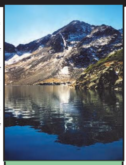
Lake Hope in the San Miguel River Basin

Also known as the State Engineer's Office, the Colorado Division of Water Resources issues water well permits, administers water rights, monitors stream flow and water use, inspects dams for safety, maintains databases of Colorado water information, and represents Colorado in interstate water compact proceedings. The Division of Water Resources strives to be a leader in the water community of Colorado and the western United States. This is accomplished by focusing on the following areas: people, water and stewardship. People, because we recognize that the business of water involves our employees and the public. Water, because the administration, safety and use of Colorado's water resources is something to which we are committed and about which we care deeply. Stewardship, because we understand and accept our obligation to the taxpayers and ourselves, in using and protecting the resources in the most effective manner possible.