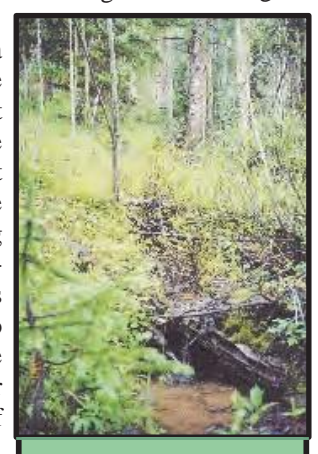
Spring near Buena Vista

Due to the various possibilities regarding spring development, each situation must be independently evaluated. Therefore, we suggest you contact Ground Water Information of this office, at 303-866-3587, Monday through Friday, from 9:00 a.m. to 4:00 p.m., or the appropriate division office, for more specific information regarding spring development (see Contact Information on the back of this guide).