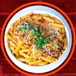
PASTAS & ENTREES