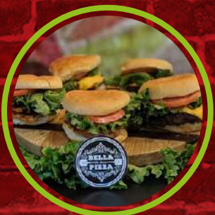
BURGER WRAP & DESSERT