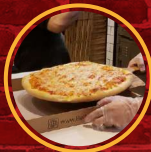
CREATE YOUR PIZZA & CALZONE