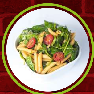
APPETIZERS & SALADS