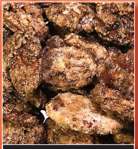
Maple Flavored Roasted Pecans