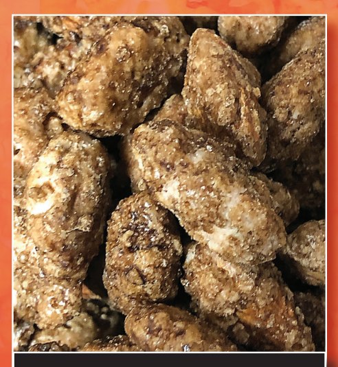
Cinnamon Flavored Roasted Pecans