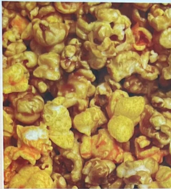
Caramel and Cheese Mix