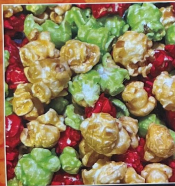
Reindeer Snack (Caramel, Green Apple and Cherry)