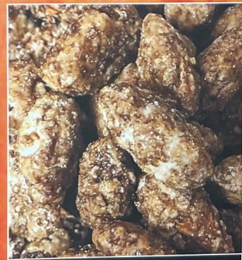
Cinnamon Flavored Roasted Pecans