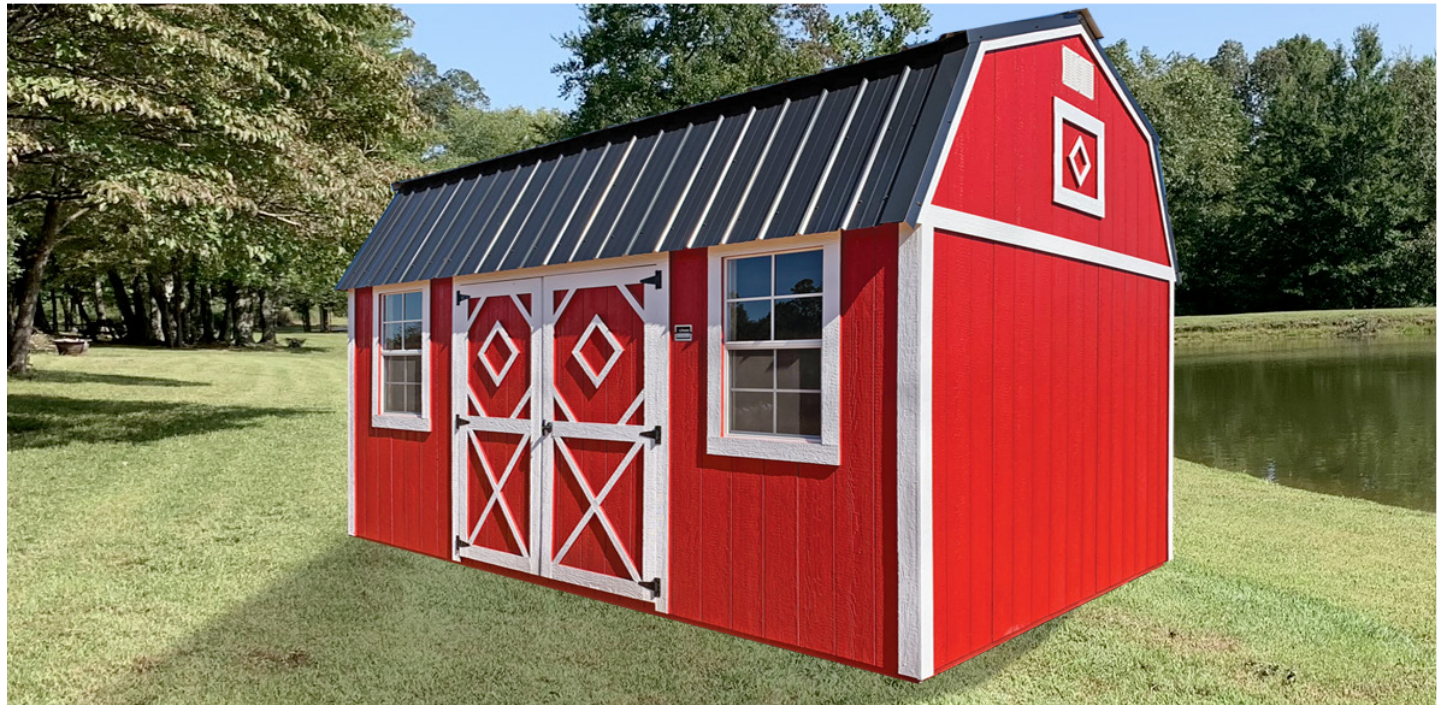
*SIDE LOFTED BARN

*Not all building types, features, options, sizes, and colors are available in all regions. Please check with your local dealer regarding availability in your area.