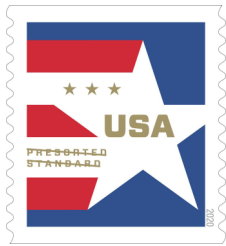
Star Presorted First Class Rate Coil rolls of 3,000 & 10,000 Feb 3—Kansas City, MO

The Presorted Star stamp is a First Class Forever rate stamp designed to meet the needs of business mailers, and is sold in self-adhesive coils of 3,000 and 10,000. According to the USPS, “this new stamp celebrates the beloved American Stars and Stripes by focusing on its vital components. The asymmetrical design includes one large white star, two white and three red stripes, and a brilliant blue background, as well as lettering and three small stars in gold.” Though not mentioned in that description, it does give the positive impression of the speeding along of mail. Greg Breeding was the art director and Matthew Pamer the designer for the stamp.