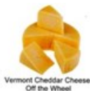
Vermont Cheddar Cheese Off the Wheel