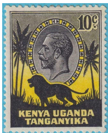
Kenya Uganda Tanganyika #48