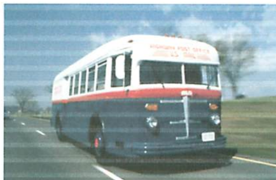
HPO Bus at the National Postal Museum in DC.

It is much harder to find a Rock & Peoria HPO cancel from a later trip. Here is one from June 22, 1959, TR (Trip 5). Notice Rockford had been shortened to "Rock",