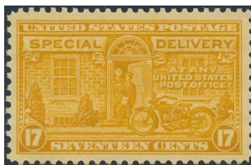
E18. 17c Motorcycle in orange yellow. Rotary press printing.