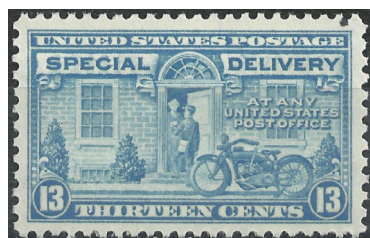
E17. 13¢ Motorcycle in blue. Rotary Press printing.