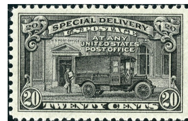
E19. 20¢ Parcel Post Mail Wagon. Rotary press printing.