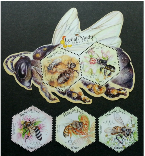
Malaysia 2019 Try to out-do this issue!