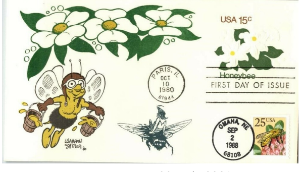
US Scott #U599 and #2281