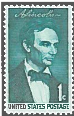
Feb. 12, 1959 Hodgenville, KY