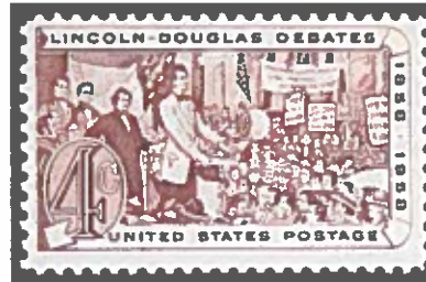
Aug. 27, 1958 Freeport, IL Lincoln—Douglas de- bate.