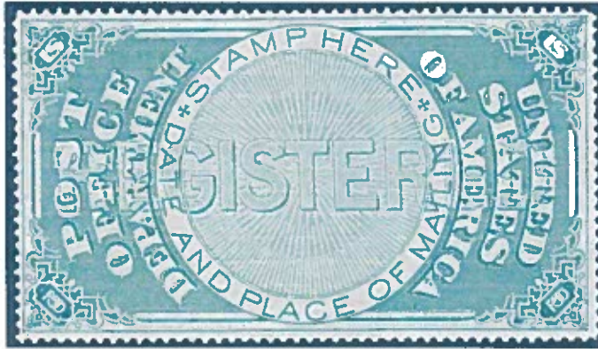
Scott # OXF1

Official Seals first appeared in 1872. The first seal was designed to prevent tampering with registered letters while in transit. Postmasters were to begin using special "Registered Package Envelopes" to transmit registered letters. As a further means of protection, a large green stamp-like seal was to be applied over the juncture of the flap.