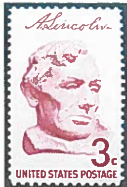
Feb. 27, 1959 New York, NY By Gutzon Borglum