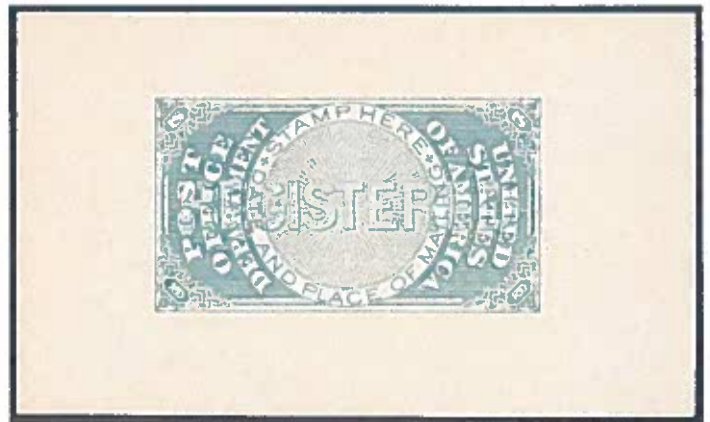
Large Die Proof on Wove Paper

Die Proofs of the issue were also produced.