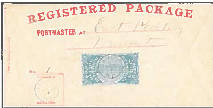
Properly used on a Registered Package Envelope

The stamp was printed by the National Bank Note Company of New York. The original design was engraved for typography by Edmund Oldham on a steel die. For reasons of economy, the printing plate was made out of copper instead of steel.