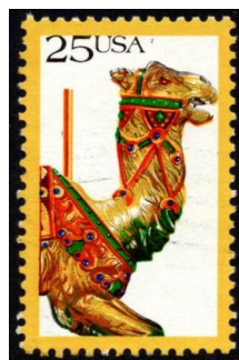
Carousel Animals U. S.—1988 Scott #2392