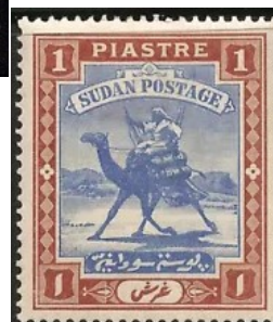
Camel Mail Sudan-1279 Scott #13