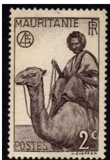
Camel Rider—1938 Mauritania Scott#76

But what happened to the camels? Their legend lives on. People see mirages on the desert and ghosts of camels. Stories were handed down and told over the years primarily by the native Arizona American Indians. One of the stories has a camel struck by lightning and turned into stone. It is called Camelback Mountain near Phoenix .