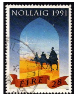
Three Wise Men Ireland Scott #848 1991