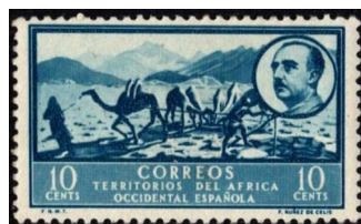
Camel Caravan—1950 Spanish West Africa Scott #3