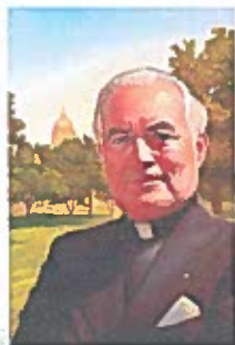
FR. TED HESBURGH USA

The Fr. Ted stamp is also being issued in coil form as a test of acceptance by mailers and a smaller roll of only 50 stamps vs 500—10,000 of definitive stamps issued for large mailers.