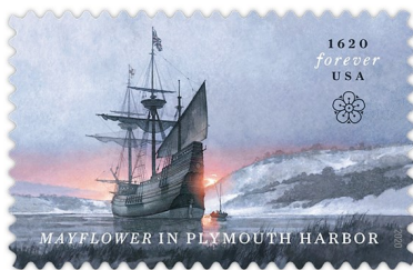
Mayflower in Plymouth Harbor First Class Forever Pane of 20 Sep 17—Plymouth, MA

The USPS has been reacting to the Covid-19 crisis and most First Day ceremonies have been canceled. Go to www.usps.gov to get the latest information about stamp releases.