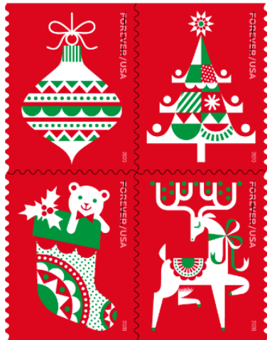
Holiday Delights Forever Rate Double Sided Pane of 20 Sep 24— Frankenmuth, MI

It is also symbolic of the popular American Thanksgiving holiday, which recalls the 1621 harvest shared by the colonists and the Wampanoag people native to the region.