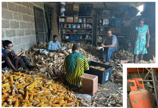
Husking & Shelling Corn