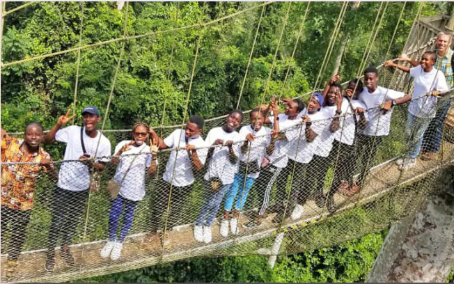
High Schoolers on a Class Trip