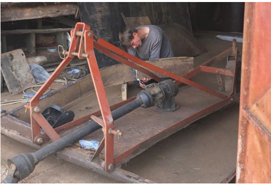
Fixing The Bushhog

We pray for wisdom and discernment as we deal with all the different requests for help ranging from medical needs to help starting a business to help with paying school fees and more. We cannot help every one but through the grace of God and because of our faithful sponsors we are able to make a difference for some.