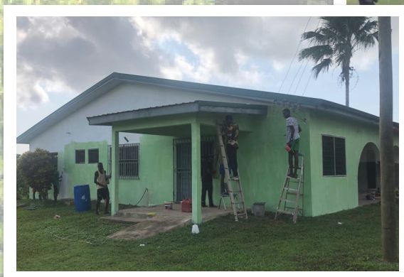
The Hope House Boys Painting