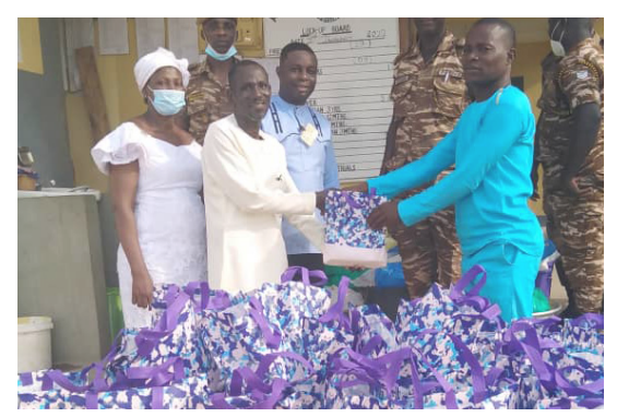
Rice & Chicken for the Inmates