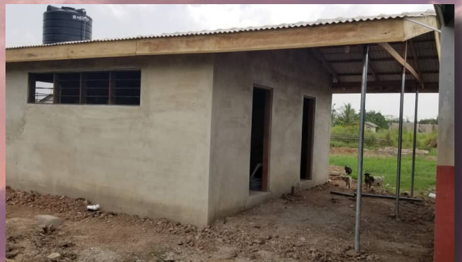
New School Building