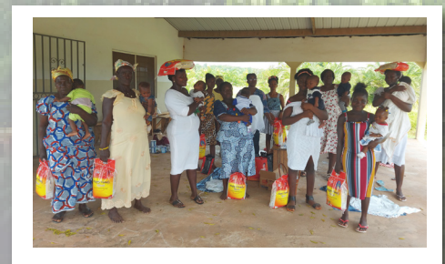
Village Baby Program

Currently we are taking care of 39 babies at the village baby program. We start at 9:30 am we first of all teach them the word of God for the first 30 minutes and then the sharing of the formula begins at 10 am. This Christmas we were able to share their rice to them and they were very grateful for the great help offered to these needy babies and also an extension of grace even to the parents to hear the word and also to get themselves rice for the Christmas occasion.