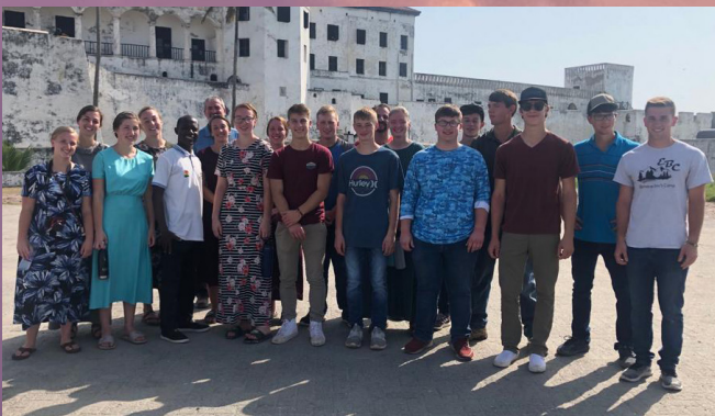
Montana Mission Group

Thank you for supporting the work of this ministry through your prayers and financial gifts.