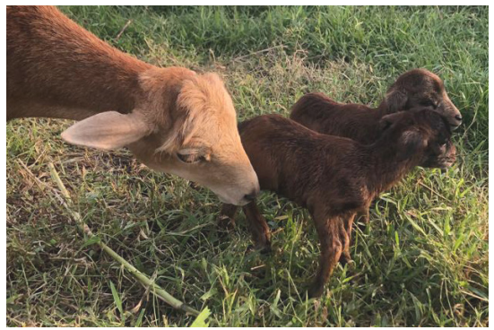
Newborn Twin Lambs

Right now is dry season so it is not the main growing season, but we do have some sweet corn, peppers, cucumbers, and okra that we are irrigating. The coconut trees that were planted three years ago are doing well. We are starting to see some buds on them. It usually takes 4-5 years for them to start producing. We are working at clearing off some more land to expand the farm. We are also doing some research and looking into starting some aquaponics here on the compound.