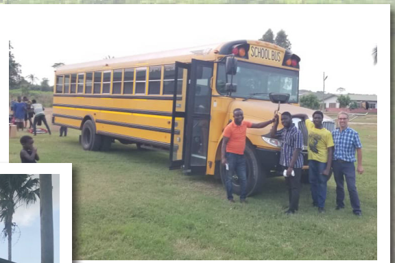
The New School Bus Has Arrived