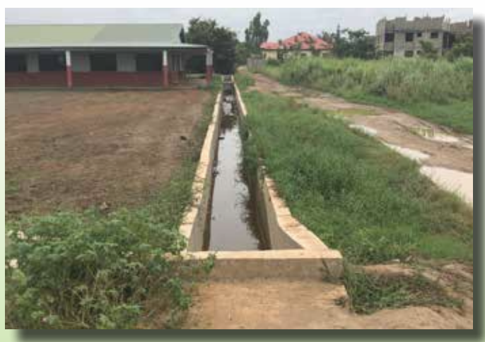
NEW Drainage Gutter at the School