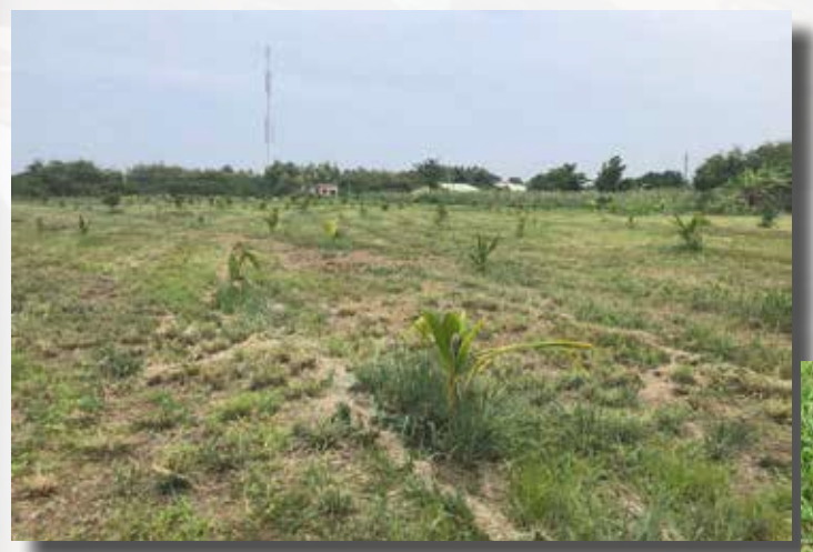
The 200 coconut trees planted last year are growing well