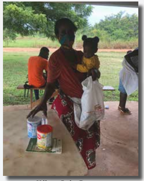
← Village Baby Program →