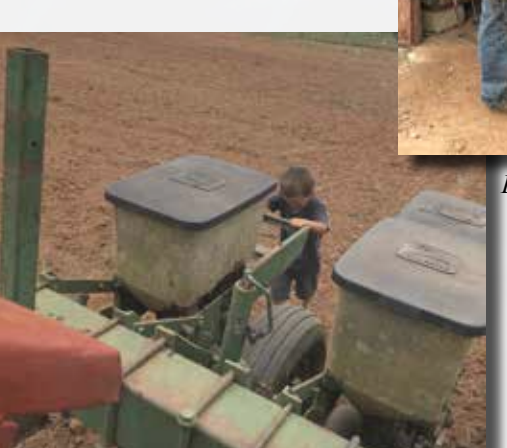
Earl Jr. helping plant corn