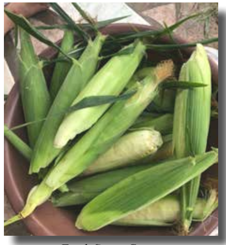
Fresh Sweet Corn