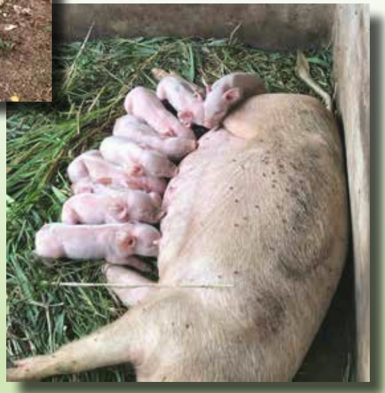
Pig with nine little piglets