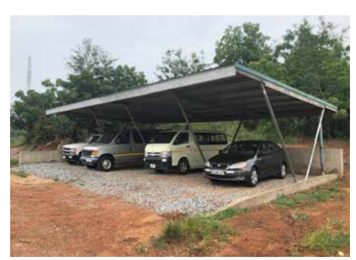
NEW Carport for Ministry Vehicles