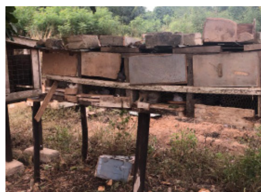
Rabbit - Meat Project