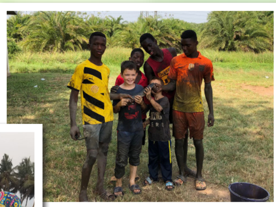
Boys mud fishing