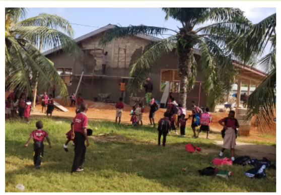
School Children Playing