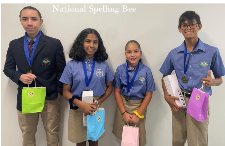
National Spelling Bee