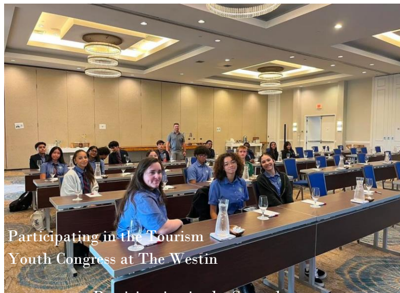
Participating in the Tourism Youth Congress at The Westin