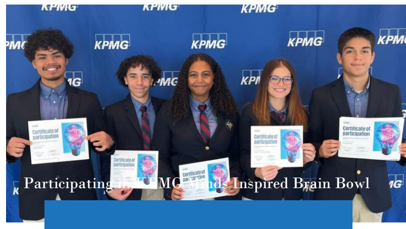
Participating in the KPMG Minds Inspired Brain Bowl