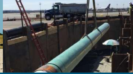
Pipeline Construction and Modification