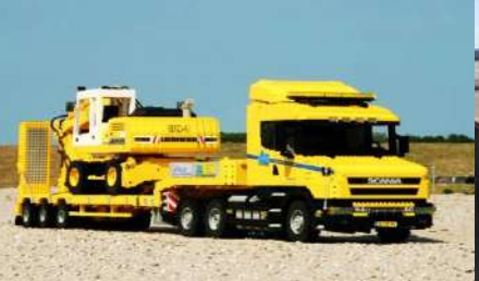
Transportation and Equipment Services