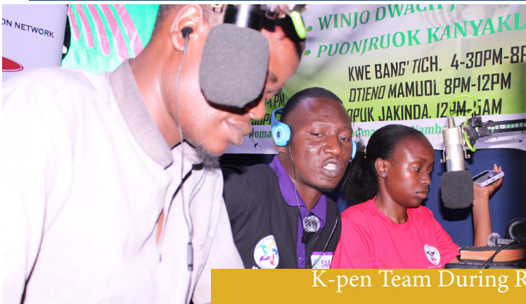
K-pen Team During Radio Talk Show