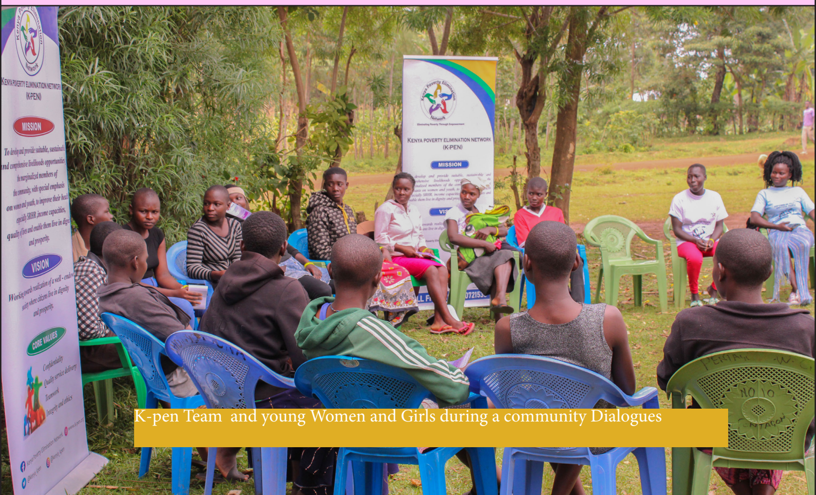
K-pen Team and young Women and Girls during a community Dialogues