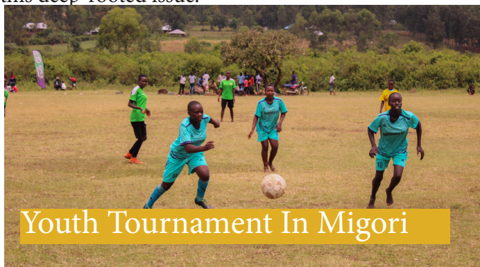
Youth Tournament In Migori

As the coach of the Harvard Soccer Ladies in Migori, my world is defined by drills, tactics, and the pursuit of trophies. Yet, my most heartbreaking losses occurred off the pitch, watching promising athletes vanish from training after falling pregnant and their dreams abruptly ended. I felt powerless, equipped with only a whistle and encouragement to combat this deep-rooted issue.