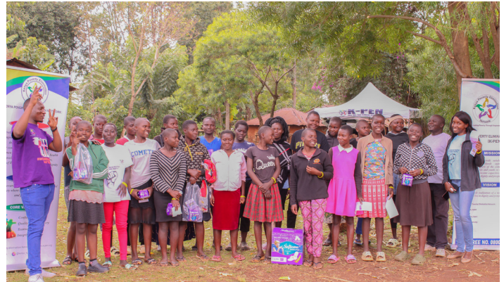
Young Girls Posing for a Photo after community Dialogue

the numbers reached, but in the quality of engagement and the tangible shift towards empowered, informed SRH choices for young women, girls and youth in Migori.