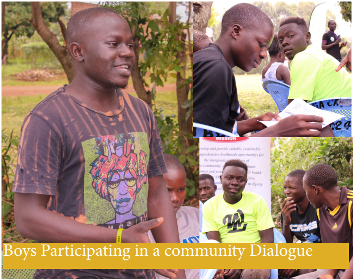
Boys Participating in a community Dialogue

For the past few years, our SRHR information sharing efforts felt like an uphill battle. We were empowering girls, yet a crucial piece was missing. We worked tirelessly with young women and girls, but often found their progress hindered by deep-seated cultural and social norms, and a lack of support from the men in the community. The dialogue felt