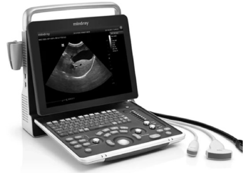
vet pro-key 75

vet pro-key 76 ultrasound system offers an enhanced imaging experience while staying true to our durability and reliability.