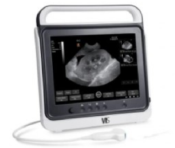
vet pro 70

vet portable 15 is the new high-end portable system which is easy to carry with you everywhere and is designed to reach the highest level of diagnostic efficiency.