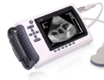
vet portable 15

vet portable 15 is the new high-end portable system which is easy to carry with you everywhere and is designed to reach the highest level of diagnostic efficiency.