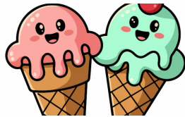
ICE CREAM PARTY