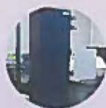
Electronic peel testing