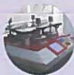
Wear resistance testing