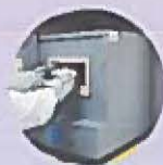
Calcination content detection