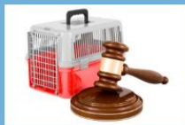
A silent auction filled with great finds