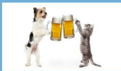
A cash bar with a curated drink menu

Stay tuned for ticket information and event updates.