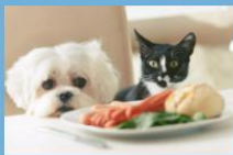
A delicious catered dinner

Join us at the Dogwood Meadow Wedding Venue for: