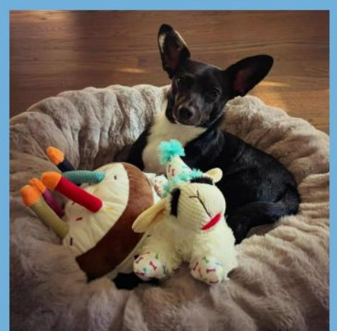
Yeah, this is my bed and my toys.