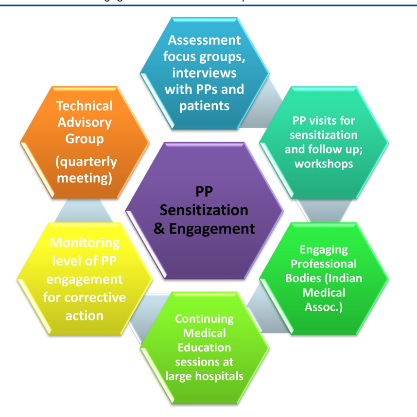
FIGURE 1. The Private Provider Engagement Process Under Project EQUIP

Abbreviations: EQUIP, Enhanced Use of Quality Drugs and Utilization of Innovative Diagnostics for TB Management in the Private Sector; PP, private provider.