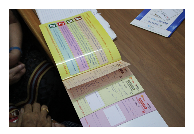
Simple guidance steps and vouchers provided by the project allowed private providers to easily refer patients for TB diagnostic testing.

At the point of project launch, no other effort had focused specifically on the issue of private providers' engagement in prevention, diagnosis, and treatment of DR-TB. EQUIP set out to demonstrate a sustainable model for private-sector engagement in DR-TB; encourage private providers to use state-of-the-art diagnostics for their patients with TB symptoms; promote the use of standardized TB and DR-TB treatment regimens with quality-assured drugs; and provide coordinated support