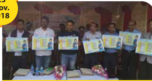
Launch of Micro-plan and active case finding efforts across all 65 sub-centres of the constituency