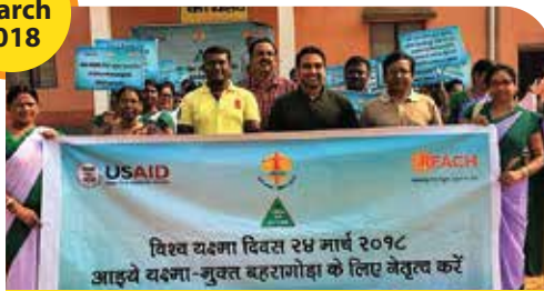
World TB Day: Rally & official launch of TB-free Baharagora campaign