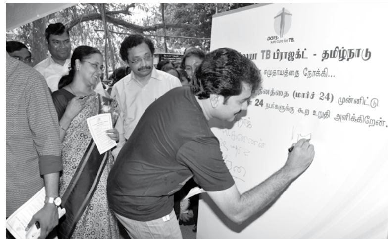
Actor and TV Personality Vijay Adhiraj participating in the signature campaign

All participants who participated in the signature campaign also received a key chain with the DOTS message. Pamphlets on TB were distributed using the kiosk by the REACH staff.