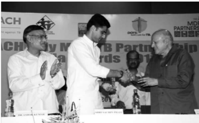
Dr.M.S.Swaminathan felicitating Shri Sachin Pilot during the Media Awards program in Delhi.