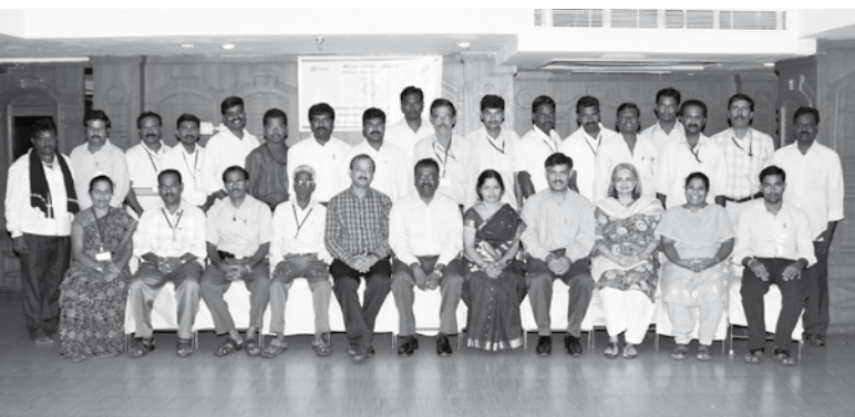
Group Photo of participants at the workshop

The REACH staff are organizing at least 2-3 GKS meetings every month for Chennai, Kancheepuram and Tiruvellore districts.