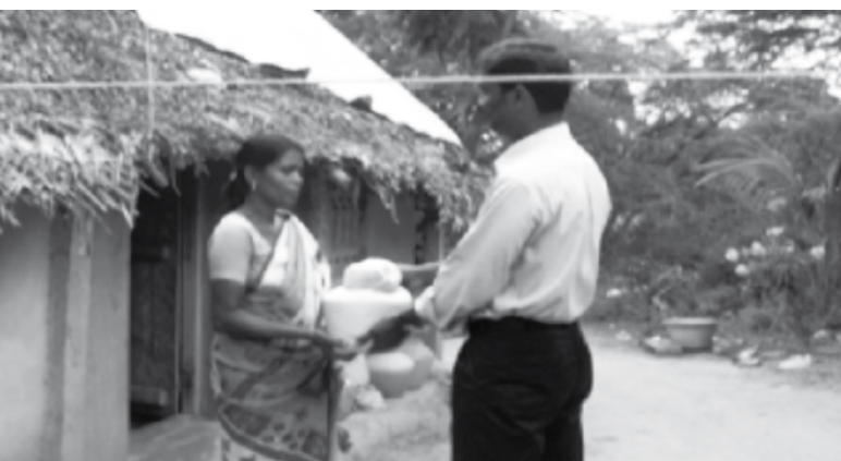
A patient's wife receiving patient aid of rice and dhal from the REACH staff