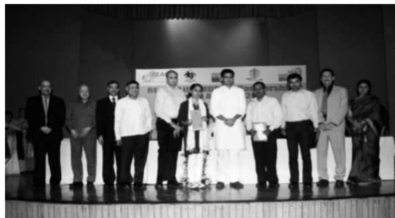
The REACH Lilly MDR-TB Partnership Media Awardees with the dignitaries on the occasion