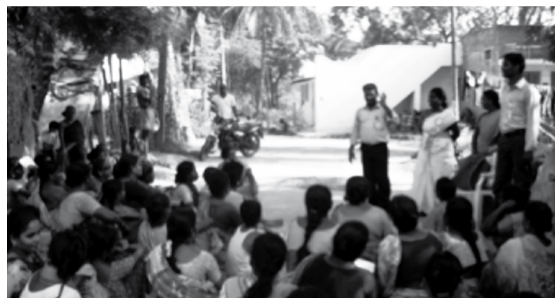
REACH team conducting a program in the Minjur Area