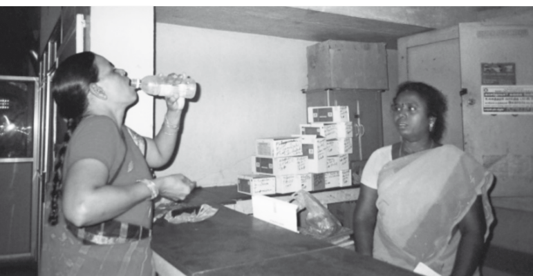
A Glimpse of the CSI Rainy/REACH DOTS Centre

The external support from REACH staff for private practitioners acts as an incentive for doctors to practice DOTS.