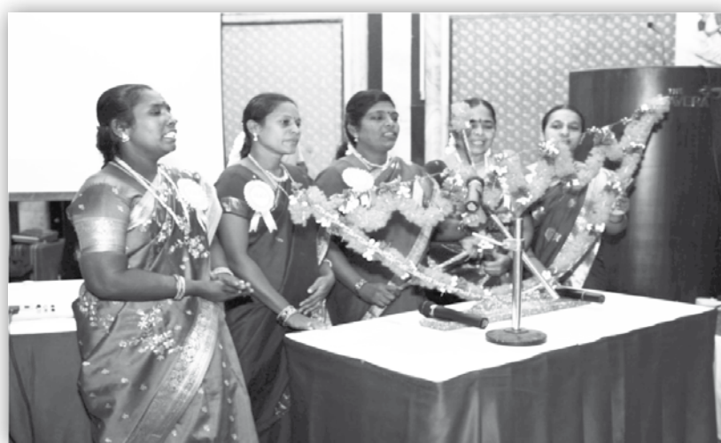
REACH staff presenting a Villupattu on TB