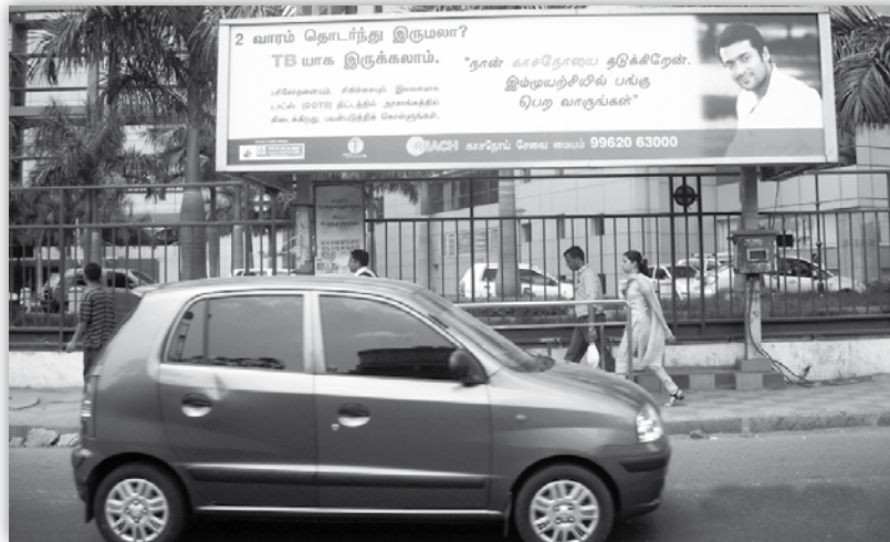
Suriya Bus Shelter Ads- on the occasion of World TB Day

providing the Signature Campaign Banners along with the Leaflets and also enlisting support of Non Governmental Organizations to participate or organize similar campaigns in other parts of the districts.