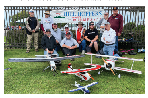
Members of the Hill Hoppers engaged with thousands of spectators at the Wings Over Wheeling event.

On September 24, 2022, I flew a Cessna 172 into the Wheeling Ohio County Airport and attended the Wings Over Wheeling Vintage Plane & Car Show. I was pleased to see that the Wheeling Hill Hoppers Club had an excellent display of model aircraft and answered many questions from the thousands of show attendees.