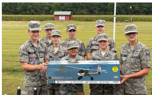
The CAP Parkersburg Composite Squadron with an AeroScout that was gifted by the Flying Wing Nutz club.

The Wing Nutz club will continue to work with