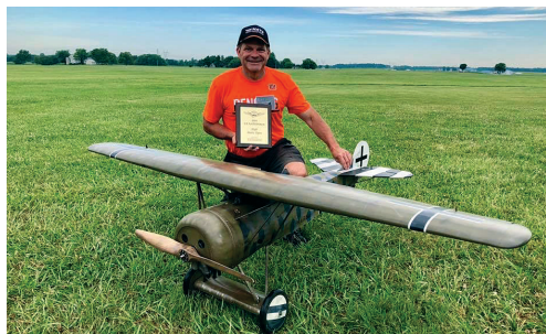
My 1/4-scale Fokker D.VIII 2019 Nats winner.

I hope that my reputation is that I am primarily "a modeler." I want to gain your respect by being approachable in person or by electronic means. In my first year, I plan to travel and spend time outside of Southwestern Ohio, getting to understand all aspects of this hobby in our district.