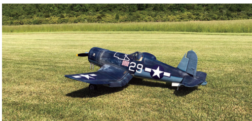
A 1/5-scale Corsair before its maiden flight.

My modeling began in the late 1960s and is not much different than most of you who have been lifelong modelers. I first started with rubber band-powered aircraft, moved to Cox plastic models, then to RC in the early '70s. My passion is building and flying Scale models and I have won once at the RC Scale Nats in Muncie, Indiana, and placed first and second in a few NASA events in Ohio, Kentucky, and Indiana.