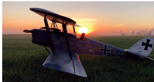
This Blue Max Tiger Moth pays homage to the movie.

since 2003. Within these clubs, I have served in various leadership positions. I am a longtime member of the Greater Cincinnati Radio Control club and have contributed to a program that we call RC101. It is a program directed at an entry-level member who has an interest in learning how to build from scratch, plans, or kits, as well as repairing ARFs or other types of models.