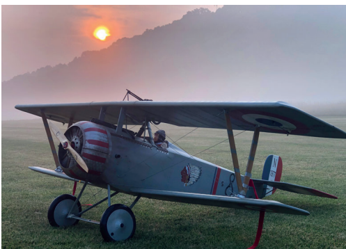
A Nieuport 17 at the IOK Dawn Patrol event.

I belong to two RC clubs in the area and have served as a District III associate vice president