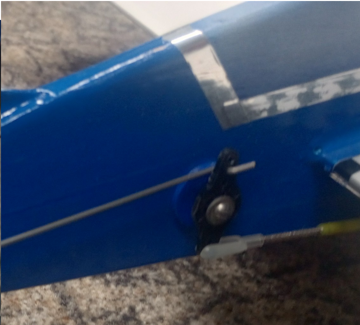
Push me - pull you fuel shutoff inspired by Dave R