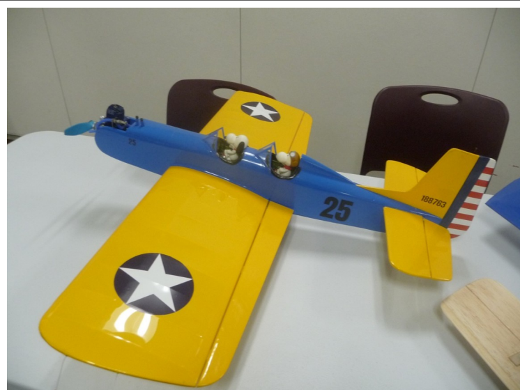
Ray's scratch built Veco Warrior with Snoopy and Spike

3114 Edgehill Rd. Cleveland Hts., OH 44118