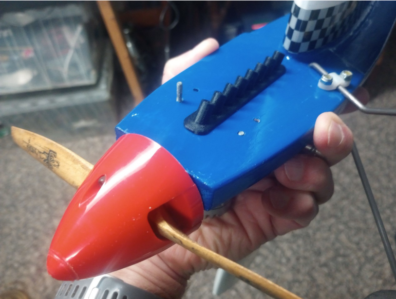
3D printed exhaust stacks