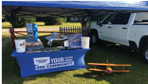
There was a combination of club and AMA information at the main gate.