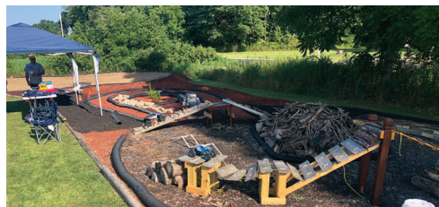
A combination RC car track and truck crawling course.