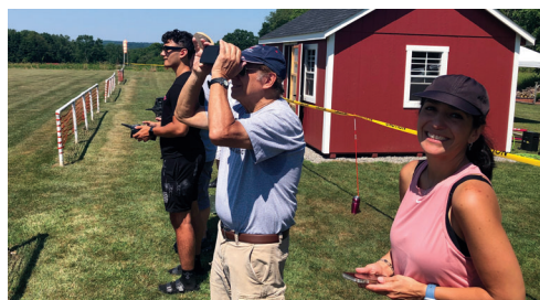
A family affair at the buddy-box station.