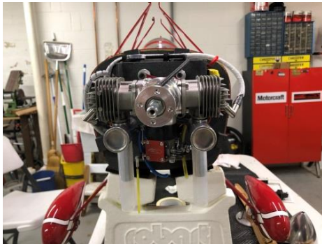
The 40cc Valley View 40 Twin fits completely inside the cowling. Perfect power for the Pitts.