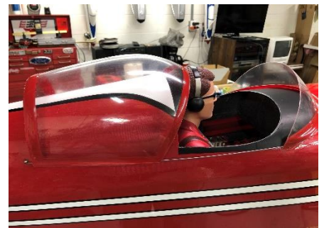
Canopy opens to allow access to the radio switches hidden inside the cockpit.