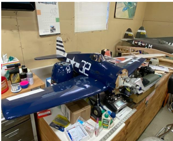
Ed's Hanger 9 15cc F6F Hellcat nearly ready to