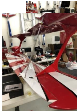
Lower wing aileron servos are concealed inside wing utilizing streamlined aluminum pushrods to operate the upper ailerons instead of separate servos. Elev. & Rudder servos concealed inside fuselage to enhance scale appearance.