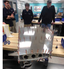
(L): Training with an RV-12 vertical stabilizer.

Below: Training for the RV-12 vertical stabilizer with mentors and key students.