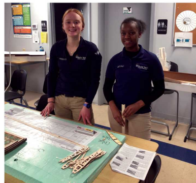
Two of the high school aviation students.