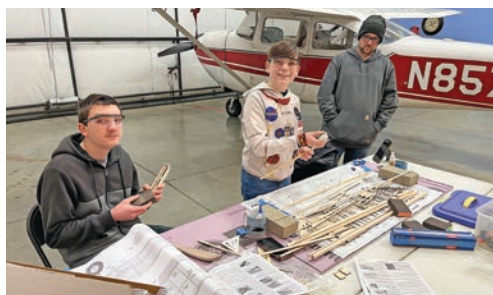
Students build the EAA LT-40 RC airplane.

EAA offers its chapters a significant discount on a complete kit program. Through the application process, chapters can obtain multiple kits, along with all of the necessary tools and supplies. The package includes radio equipment, servos, glue, covering materials, irons, a flight simulator, and more.