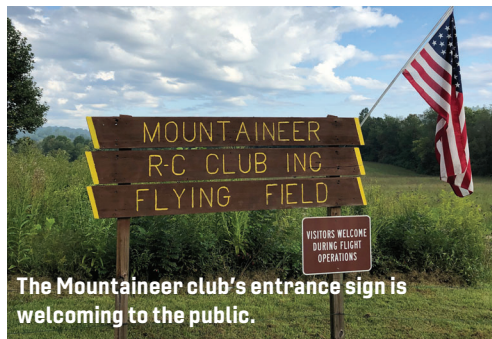
The Mountaineer club’s entrance sign is welcoming to the public.