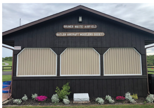
The club shelter.

The club enjoys a beautiful grass runway situation on top of a knoll with ample flyover area, club house with public facilities, workshop, and a shelter for picnics and other outdoor events. The property is managed by an LLC; each year the LLC makes improvements to the facility. This summer, it is adding additional electric-hookup sites for campers and a small pond for model boating activities.