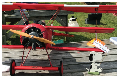
This Foker Triplane was flown at the inaugural Warbirds Over Carlisle event.