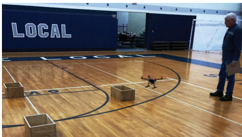
A Hill Hoppers member judges a drone drop zone at the Sea, Air and Land Challenge.