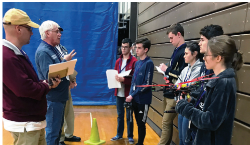
Members of the Hill Hoppers Club quizzing students about their drone projects.