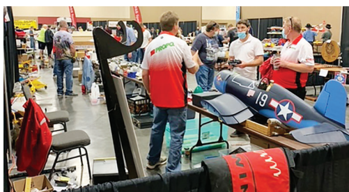
A partial view down one of the large aisles providing plenty of room for swappers and vendors.