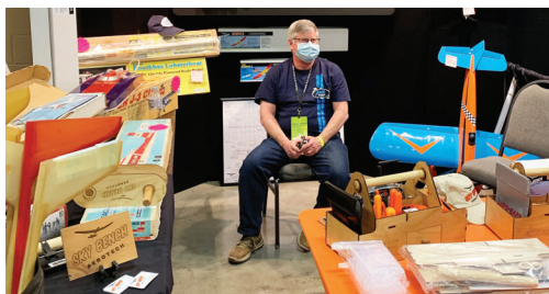
One of several vendors who attended the Toledo Swap Meet.

“This is a perfect place to meet old friends and make new ones. At one of the concessions stands, I sat down with an old friend to share a little hangar talk and listen to the announcer call numbers for door prizes. I returned the next day looking for the things I needed. I talked with several vendors who were there showing products before the auction.