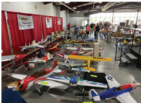
Saturday's auction lineup.