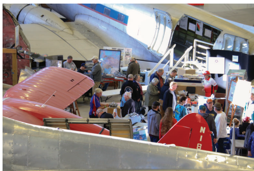
The modeling crowd mixed in with a full-scale DC-3 and Fairchild 24.

This year, the attendees and vendors numbered nearly 400 for the one-day event. The Mad River Flying Club celebrated its 25th anniversary last year and was awarded an AMA certificate to commemorate the achievement.