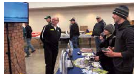
The AMA District III booth was busy. Lots of people flew the simulator at the Lebanon PA event.