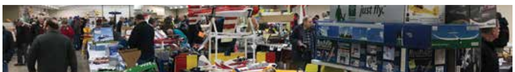
This was just one of four assembly halls that comprised the model swap area at the Lebanon gathering.