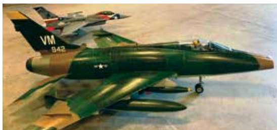
These jets were on static display at WMAA Model Show & Swap Shop in Ohio.