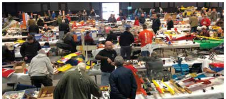
A view of some of the action at the WMAA Model Show & Swap Shop.