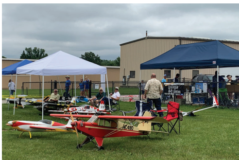
A nice model aviation display by the IFC at the Jimmy Stewart Airshow.

"It was very cool attending the air show briefing with famous air-show pilot Michael Goulian because both the model pilots and full-scale pilots are expected to comply with the same rules and safety regulations of the air show.