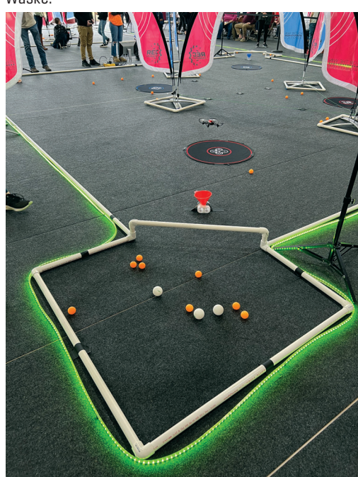
Drone teams utilize their aircraft's propeller wind to move ping-pong balls to designated areas to score points. Fun for all!