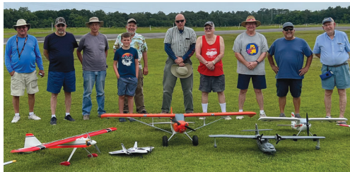
A few of the members of the Azalea City Model Aeronautics Club showed me a good time.

I spent the day flying and talking to the club members about the club activities, which includes buddy boxing students and fundraising for the community. Thank you, Azalea City Model Aeronautics, for welcoming me to your club.