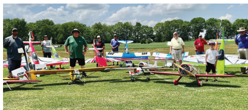
Some of the pilots and airplanes that attended the Pegasus Potluck Fun Fly.

Incidentally, although the Pegasus club is in Maryland, it is considered District III because the club president lives just across the border in nearby Pennsylvania. I am looking forward to attending more events with this fine club.