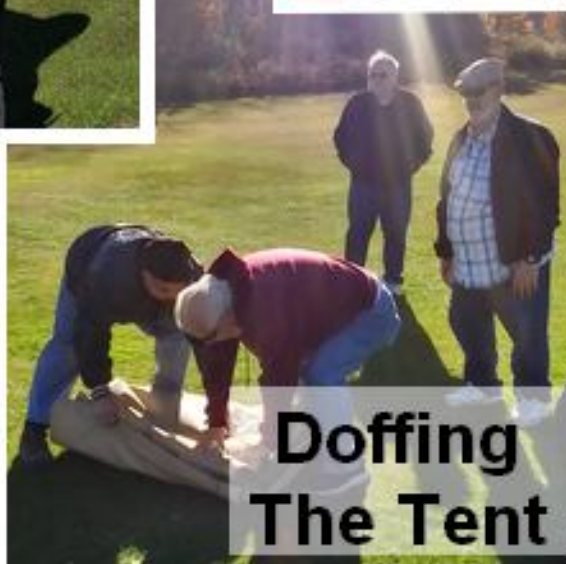
Doffing The Tent