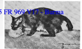
Wong Mau and Kitten

Brown hybrid Burmese () - CFA 15 FR 969 V17 - Burma