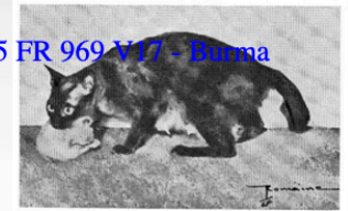
Wong Mau and Kitten

Brown hybrid Burmese () - CFA 15 FR 969 V17 - Burma