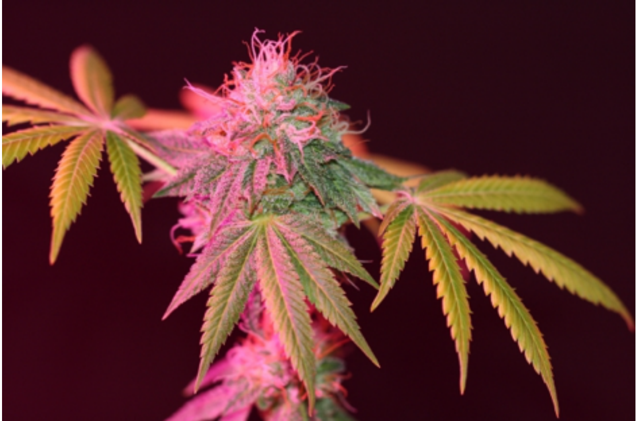
Hot Spot #5 @ 6.5 weeks