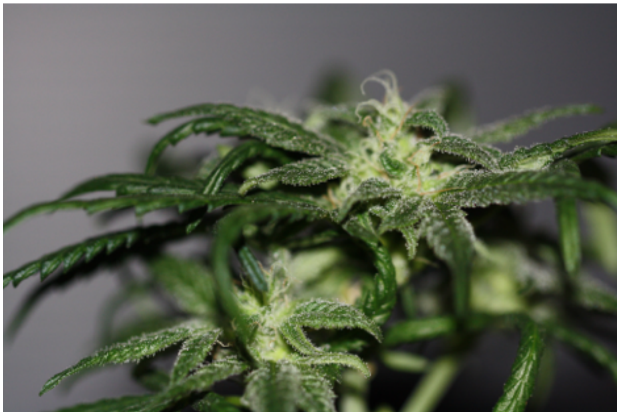
'91 Christmas #5 @43 days - nice chem smell to her with dense nugs.