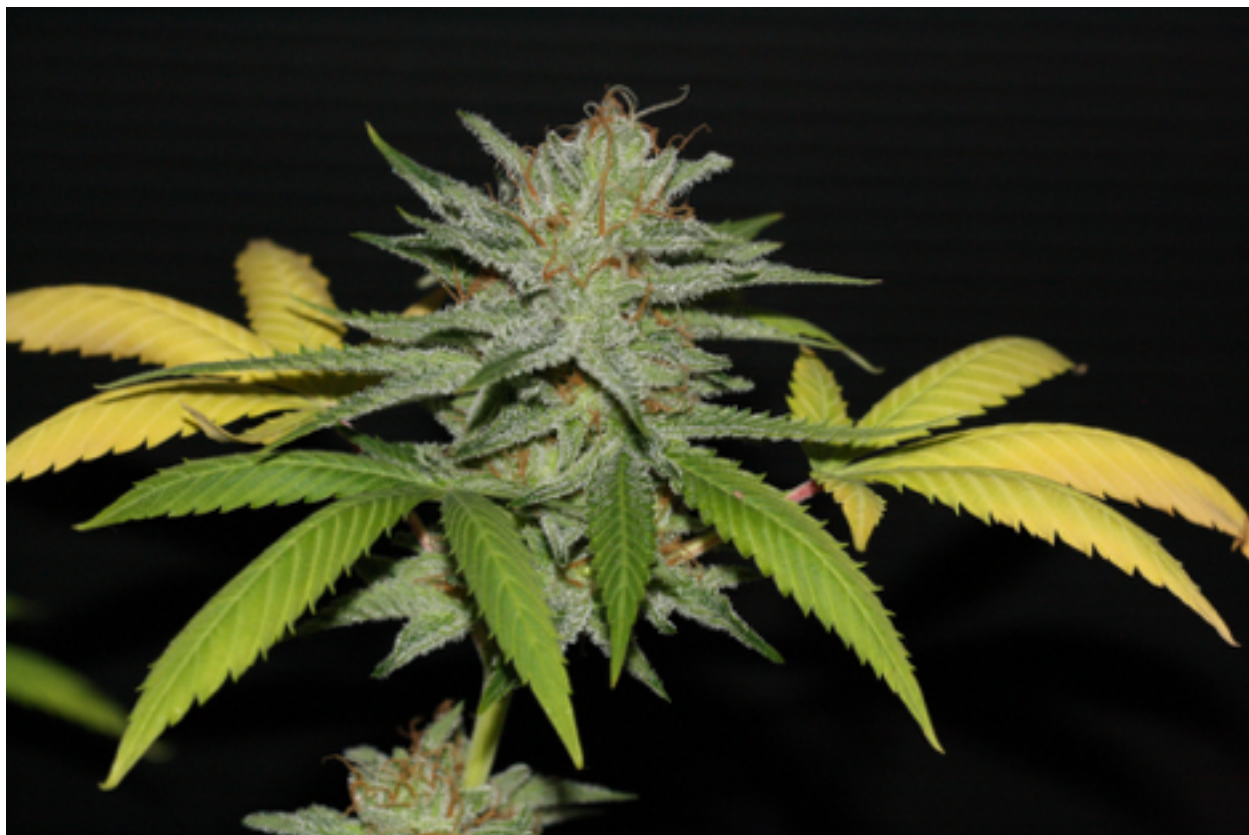
Love Triangle #8 @ 53days.