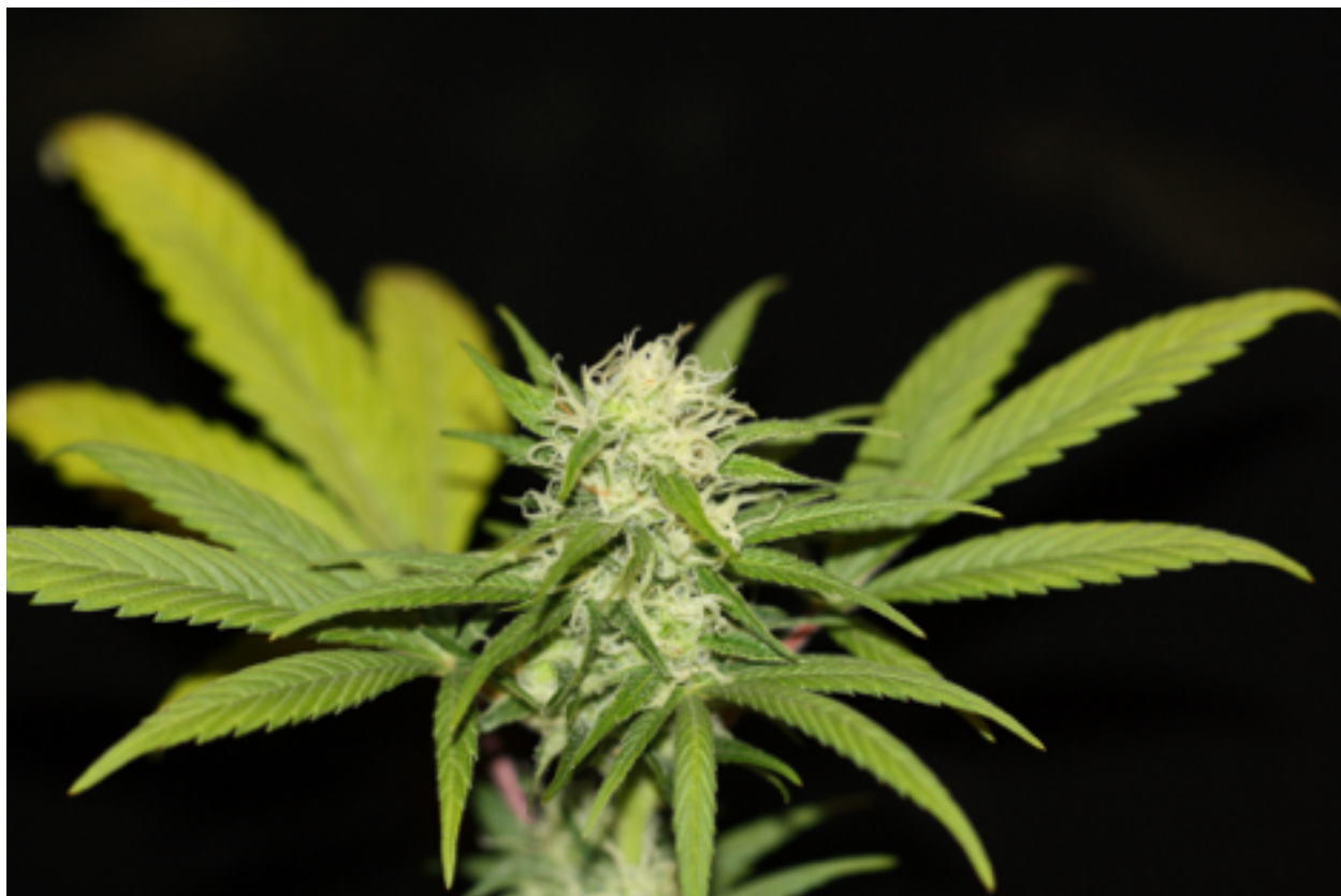
7.5 weeks of flower