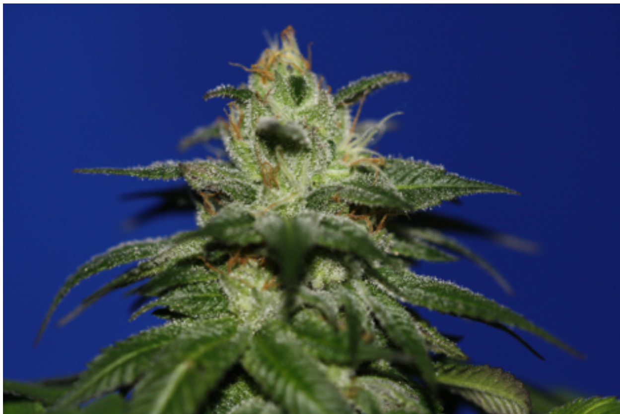
Last edited: Jun 7, 2019 OG Jack #2 @86days.