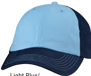
Light Blue/ Navy