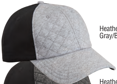
Heather Light Gray/Black