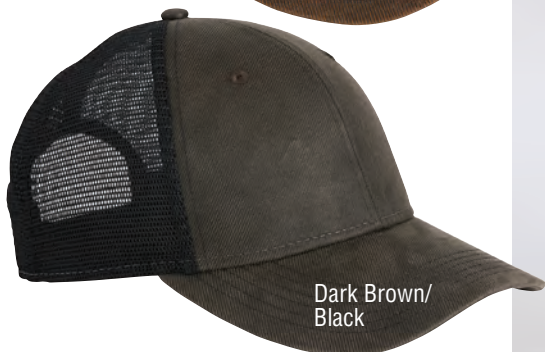
Dark Brown/ Black