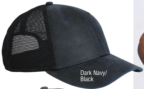
Dark Navy/ Black