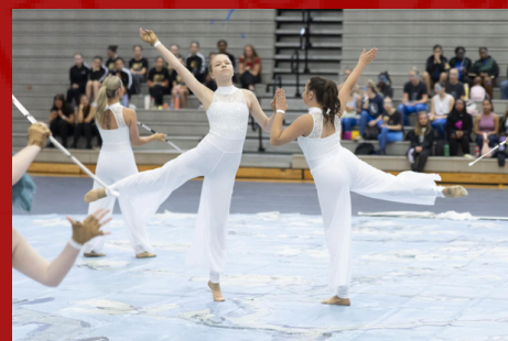
2025 WINTER GUARD