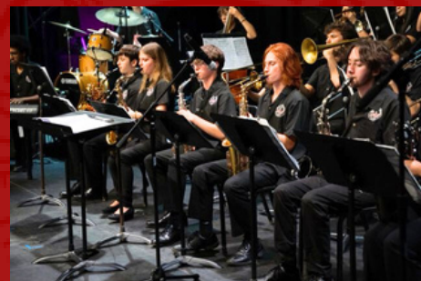
SUPERIOR JAZZ BAND

LIKE US ON FACEBOOK @TATE HIGH SCHOOL SHOWBAND OF THE SOUTH