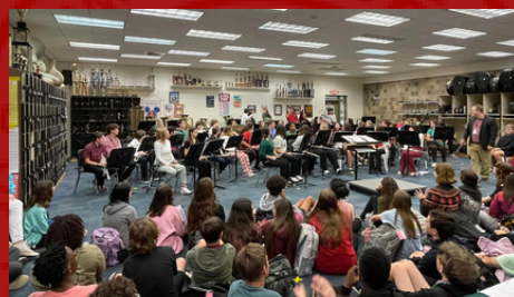
PERFORMING FOR LOCAL MIDDLE SCHOOL STUDENTS

MOMENTS IN MOTION: MEMORIES MADE POSSIBLE BY OUR SPONSORS