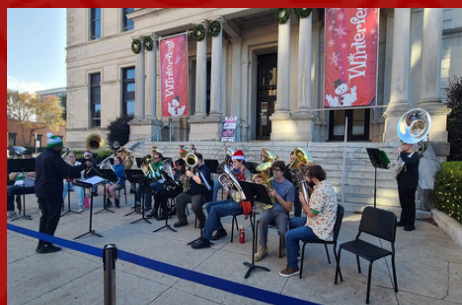
PERFORMING THROUGHOUT THE COMMUNITY