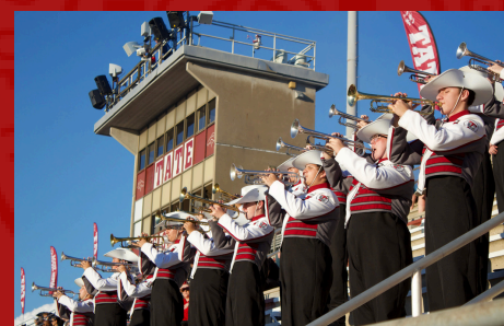
FRIDAY NIGHT LIGHTS FOR OUR AGGIES