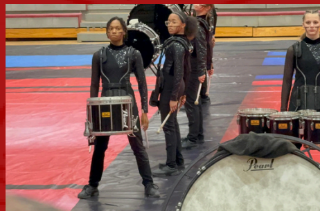
2025 INDOOR PERCUSSION