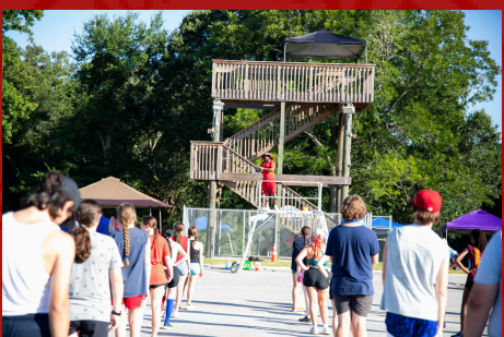
BAND CAMP 2025