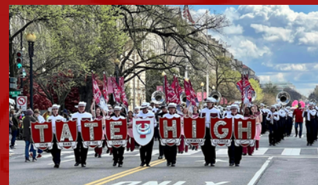
SHOWBAND IN WASHINGTON D.C.